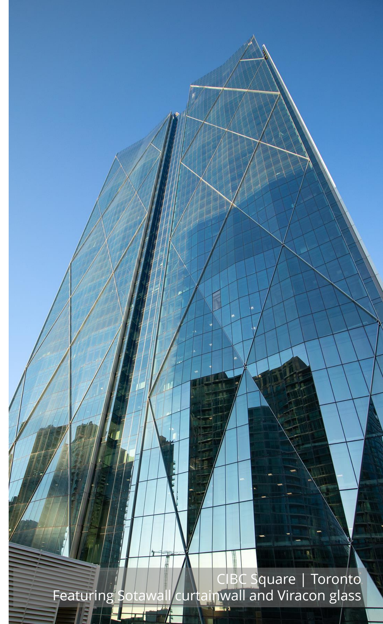
CIBC Square | Toronto Featuring Sotawall curtainwall and Viracon glass