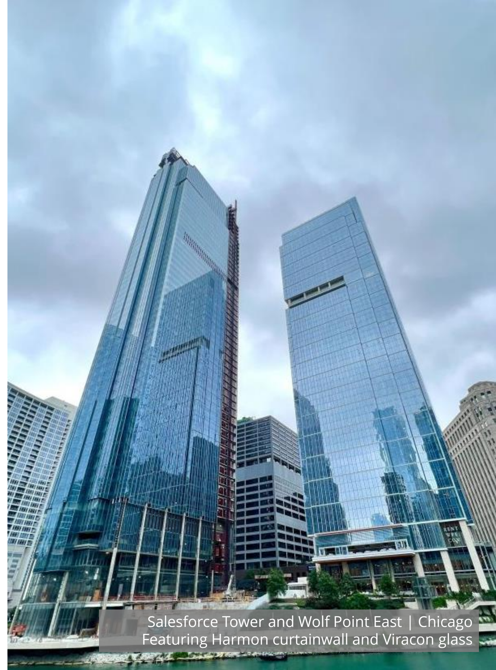
Salesforce Tower and Wolf Point East | Chicago Featuring Harmon curtainwall and Viracon glass